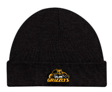
AJM Acrylic Toque- Black or Charcoal, One size -100% Acrylic -Rib knit with cuff Grizz Scratch Logo $17.00 + tax OMHA Logo $22.00 + tax *Price does not include number - $7/ea